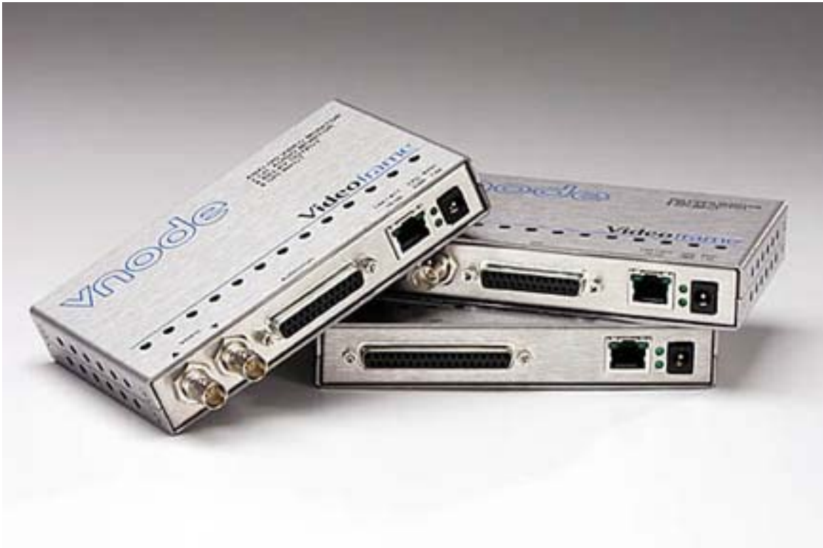
Figure 3 – VNODE Spot Signal Monitoring Units

The VNODE solution is recommended for systems where monitoring points are few in number or for situations where the monitoring points are spread out thinly over a wide area. There may also be situations where centralized monitoring is not a requirement. The small "zero rack unit" package can be mounted anywhere. This can be an advantage when there are no rack units left or rack space is tight, for example, in older installations or in trucks.